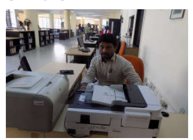
HP Scanjet Enterprise Flow 7500 scanner.

Central library is actively engaged in digitization of institutional publications, project reports and previous years examination question papers and also scanning and uploading of important events, photographs and videos.